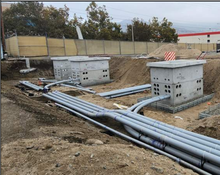
Underground Utility Install