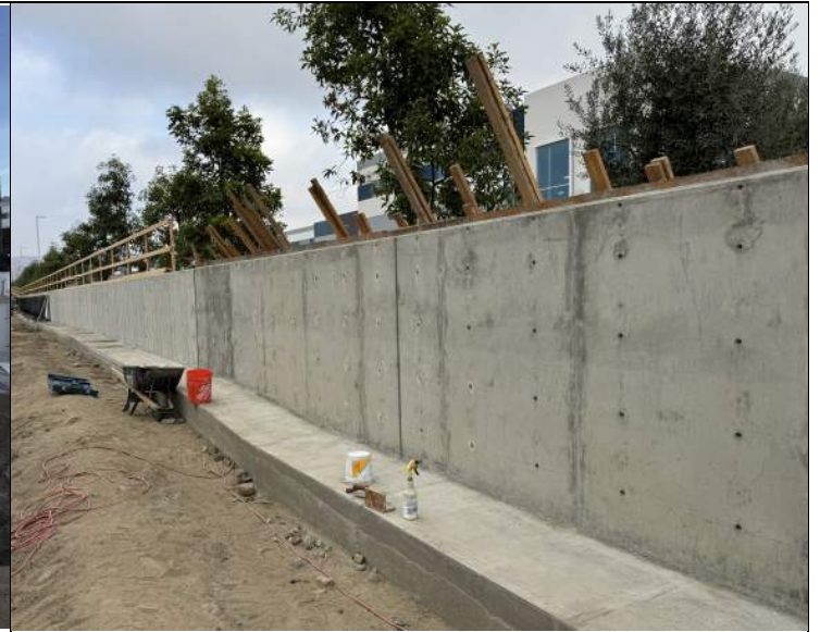
Site Retaining Wall