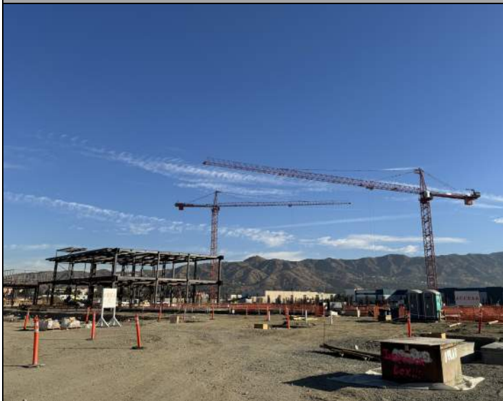
Terminal Area C Steel