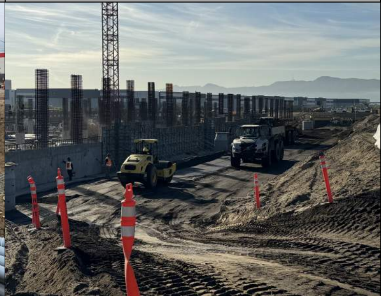
Site Civil Work