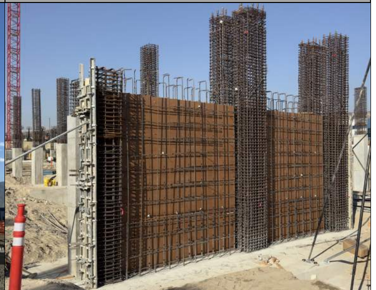
Garage Wall Rebar