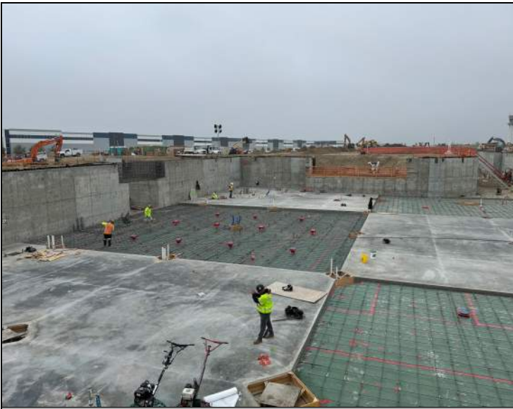
Future Terminal Baggage Handling System Space